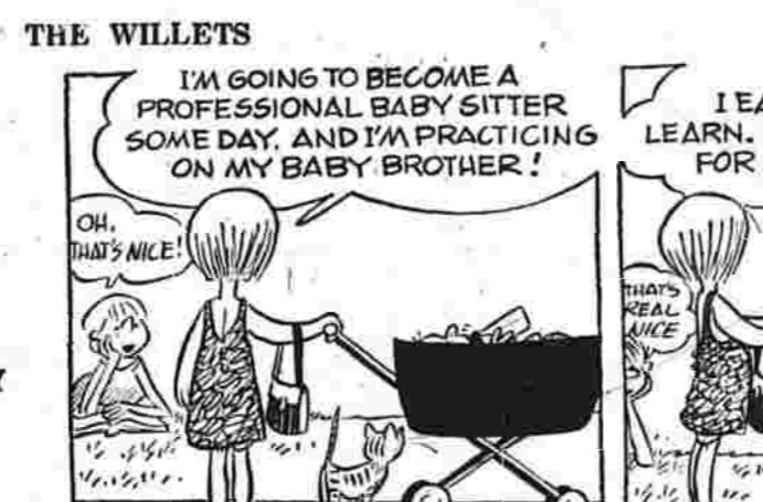
THE WILLETS BY WALT WETTERBERG