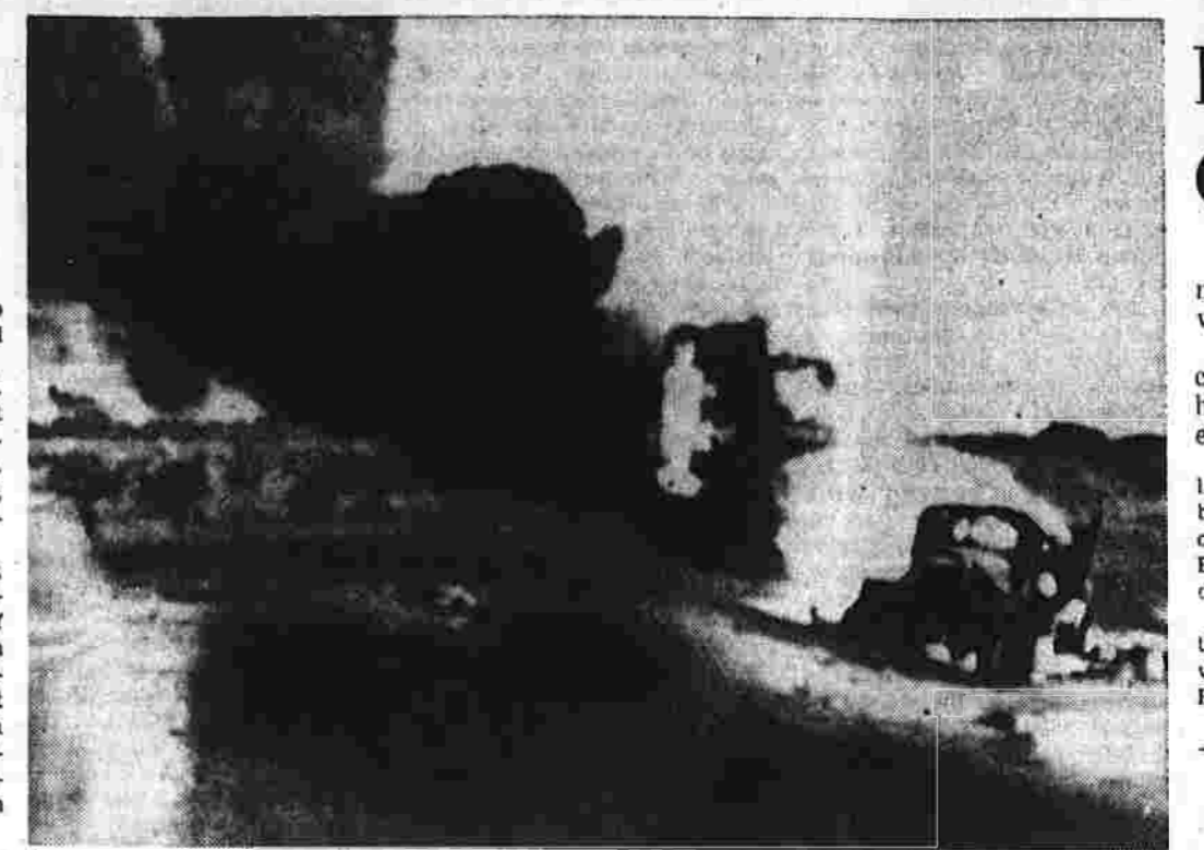
According to Israeli sources this cable photo from Tel Aviv shows an Egyptian army truck burning on the road to Gaza in the Gaza Strip.