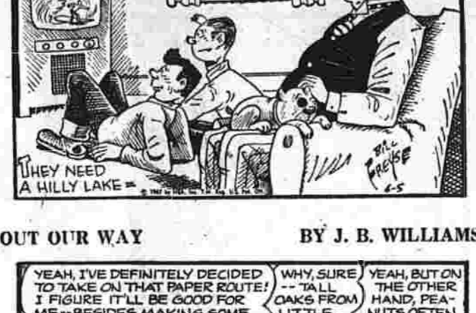
OUT OUR WAY BY J. B. WILLIAMS