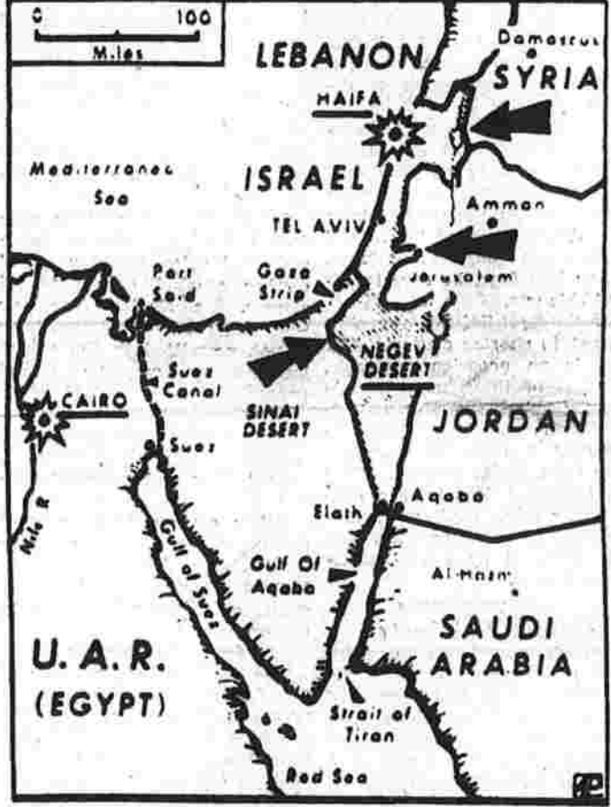
Arrows indicate where Egyptian, Jordanian and Syrian forces were reported in battle with Israel. Bomb symbols are at Cairo, which Egypt said had been bombed, and Haifa, where Syria said it bombed oil refineries.