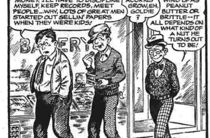
BY LEFF and McWILLIAMS