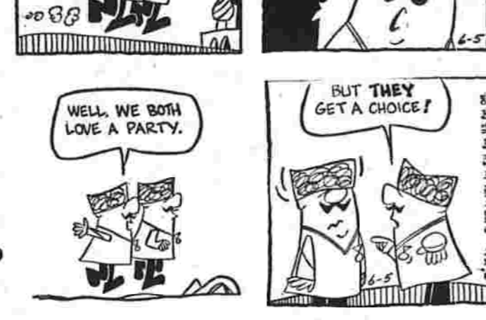
SHORT RIBS BY FRANK O'NEAL