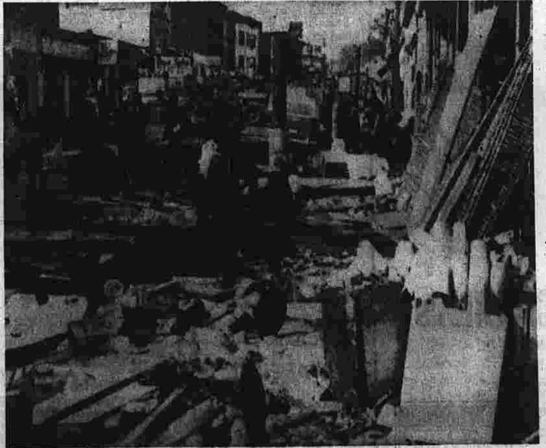
This was the scene on a street in the Roxbury section of Boston after night's rioting, looting, arson and sniper fire. The predominantly Negro area was reported quiet today—the first time since Friday. (AP Photofax)

NEWARK, N.J. (AP) — A giant power failure hit the East Coast from New Jersey to Maryland and Delaware at mid-morning today. An hour later electricity trickled back in scattered areas, including parts of Philadelphia, northern Delaware and Maryland, southeastern New Jersey and Elizabeth, a city in northern New Jersey. But much of the four-state area — which had escaped the great Northeastern blackout of November, 1965 — was still without power after noon. Railroads said evening commuter schedules were threatened. New York City and other areas hit by the 1965 blackout (See Page Fourteen)